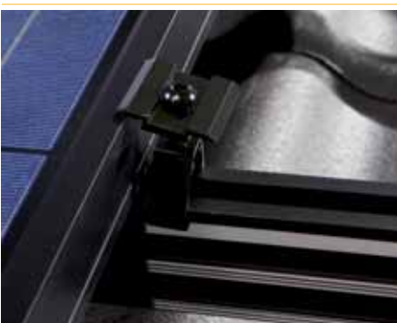
Mount the middle clamp