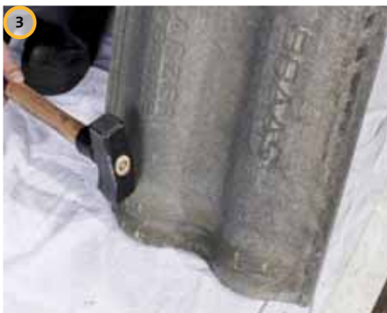
3 Cut a recess in the covering roof hook, if necessary