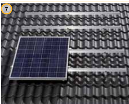
7 Positioning of the first PV-module