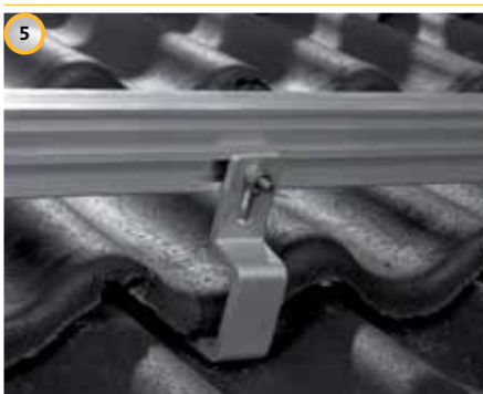
5 Mount the mounting rails