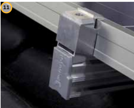
11 Mount the end cap