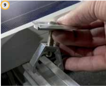
9 Mount the middle clamp