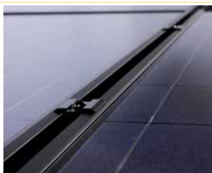
VarioSole SE blackline