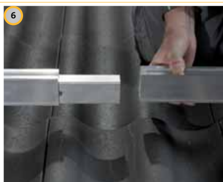
6 Connectors are required to connect rails together