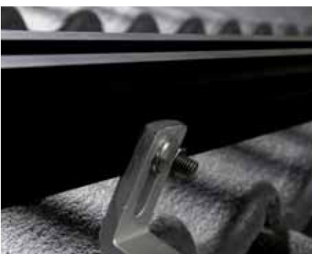
Mount the mounting rail