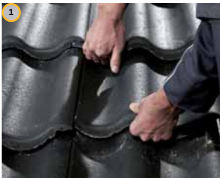
1 Move or remove the roof tile