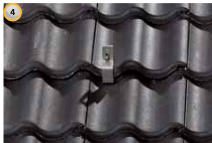
4 Place the roof tile