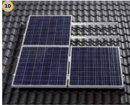
10 Mount the next PV-module row