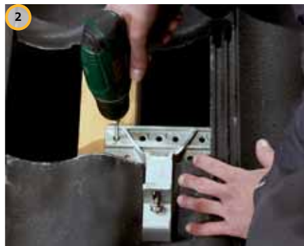
2 Fix the roof hook