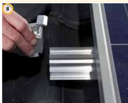
8 Push the end clamp onto the mounting rail