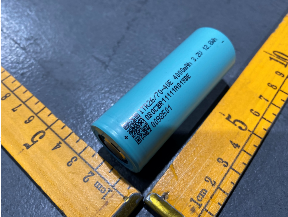
Figure 3 Overall view of cell (电芯图)