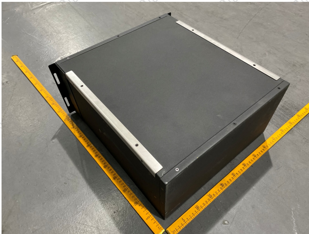
Figure 2 Overall view II of battery (外观图II)