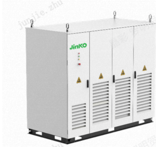
DC cabinet (left)+PCS cabinet (right)