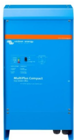
MultiPlus Compact 12/2000/80

When connected to the Ethernet, systems with a Color Control panel can be accessed and settings can be changed.