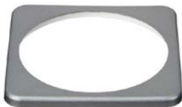
BMV bezel square