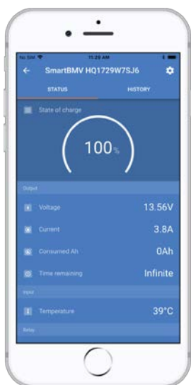
See the VictronConnect BMV app Discovery Sheet for more screenshots