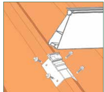
1 Mounting of the Fix2000ClickTop connector.

Moreover, there must be minimum distances of 1.5 m to the lateral roof edges, and distances of 1.2 m to both the north and the south roof edge.